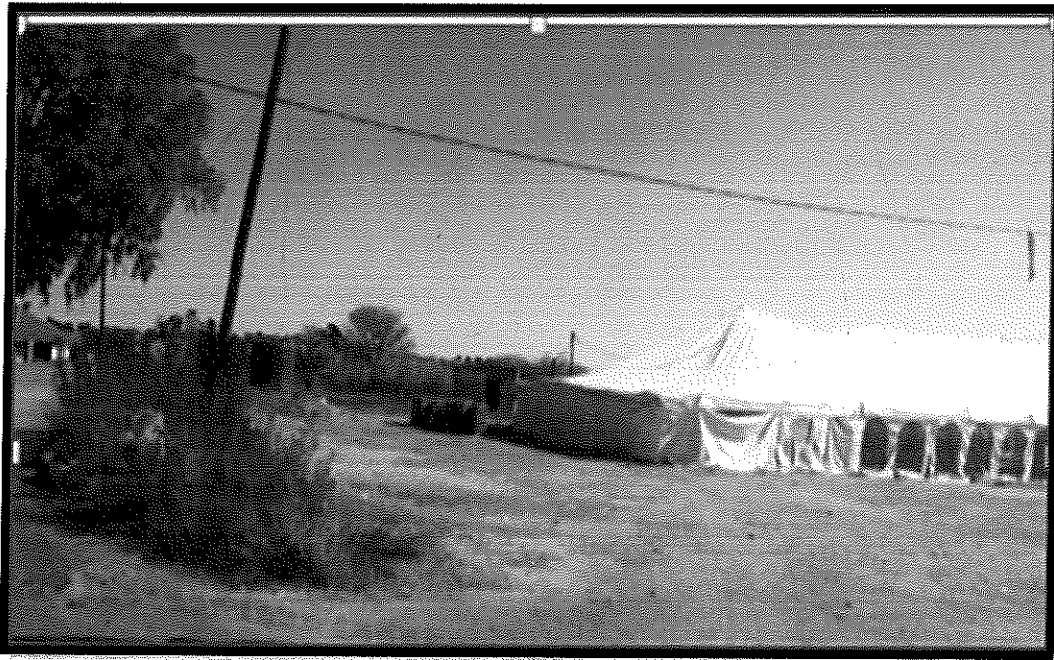
SEA POINT, MASERU URBAN AREA

19/10/2008/906/11/1/1/1 M. M. M. 19/10/2008/906/11/1/1/1