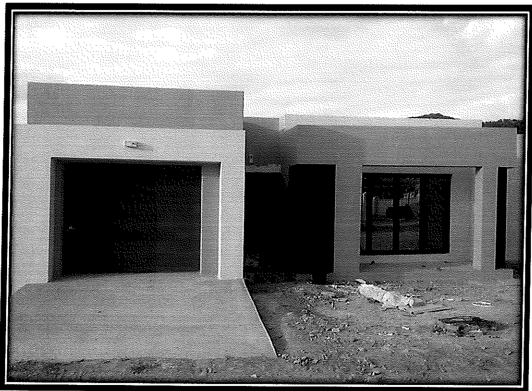
HA FOSO, MASERU URBAN AREA